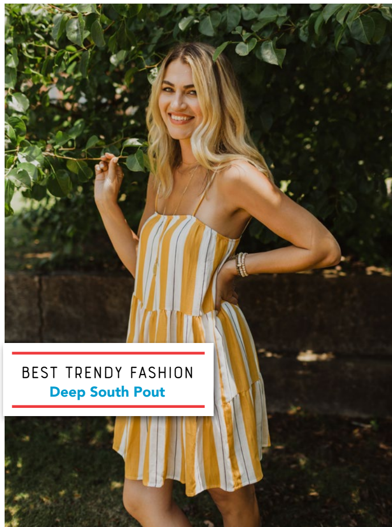
BEST TRENDY FASHION Deep South Pout