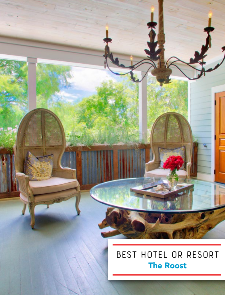
BEST HOTEL OR RESORT The Roost