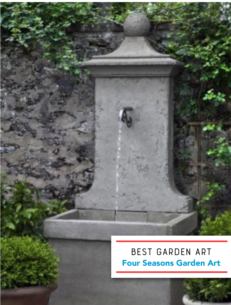
BEST GARDEN ART Four Seasons Garden Art