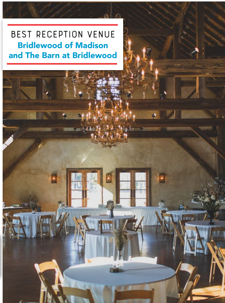
BEST RECEPTION VENUE Bridlewood of Madison and The Barn at Bridlewood