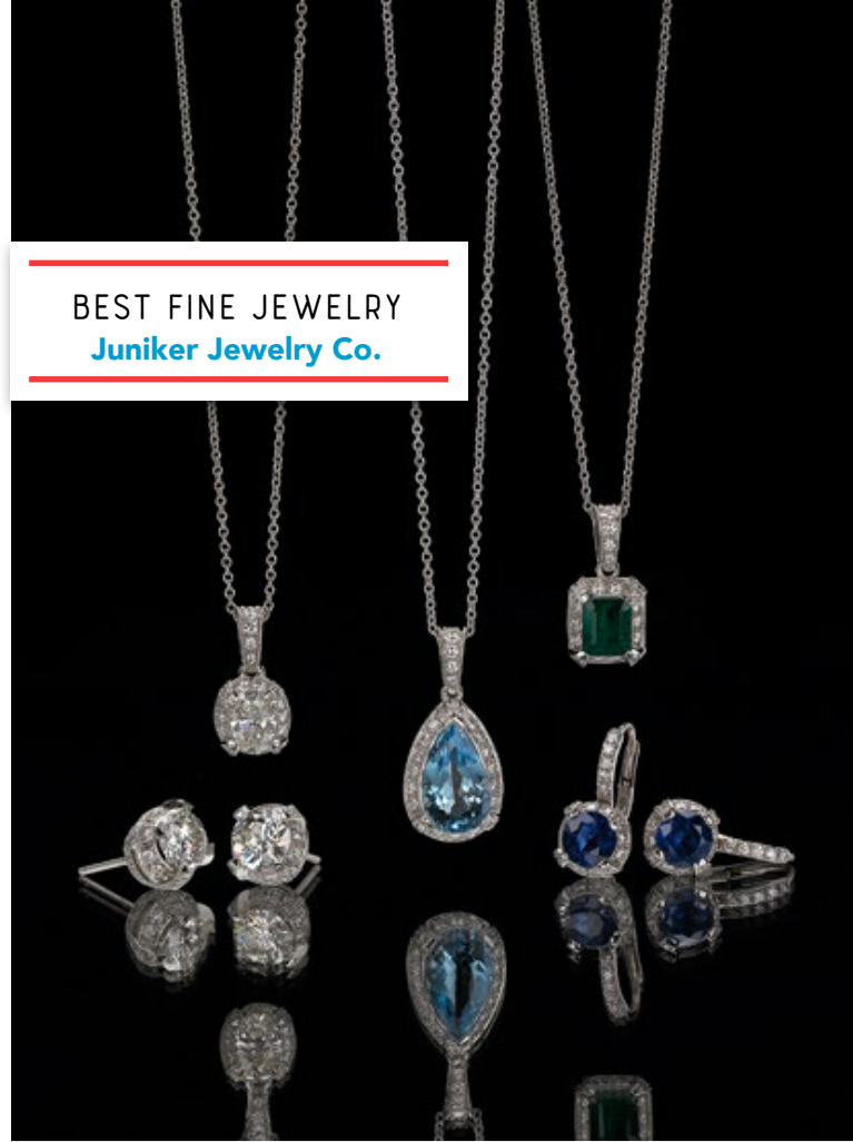
BEST FINE JEWELRY Juniker Jewelry Co.