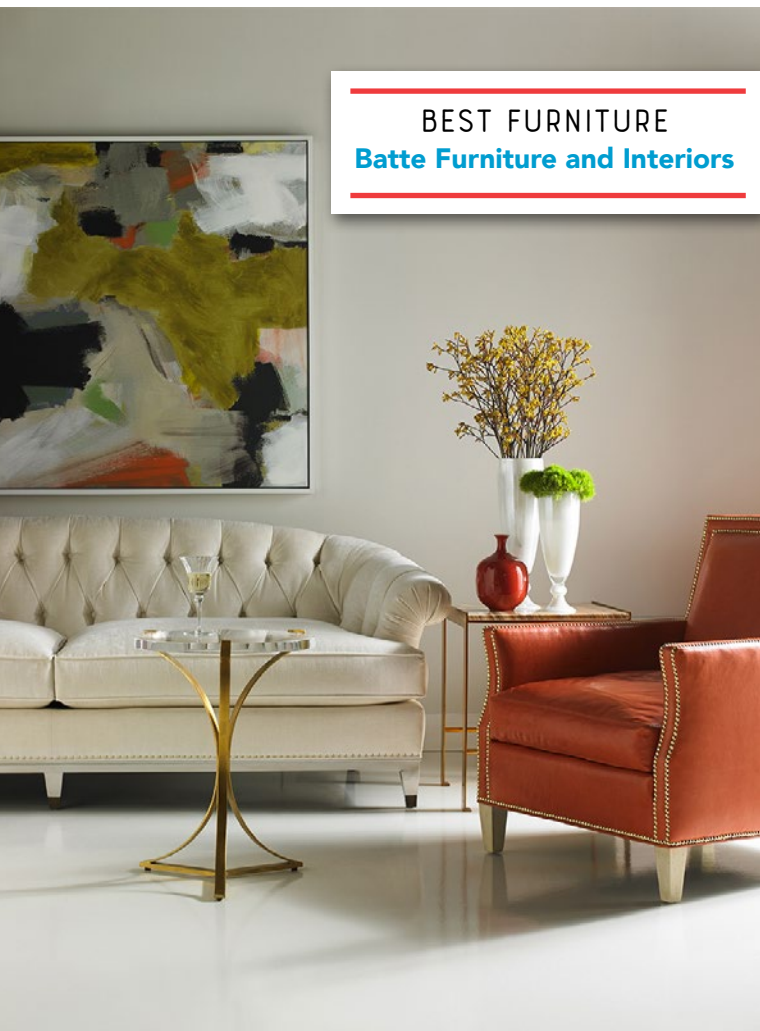
BEST FURNITURE Batte Furniture and Interiors