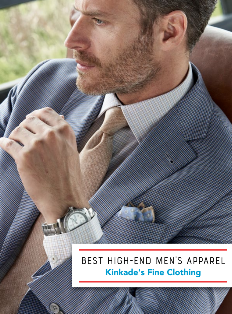
BEST HIGH-END MEN'S APPAREL Kinkade's Fine Clothing