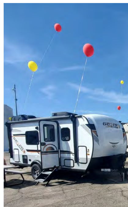
BEST CAMPER/RV SALES AND RENTALS Paw Paw's Campers and Cars