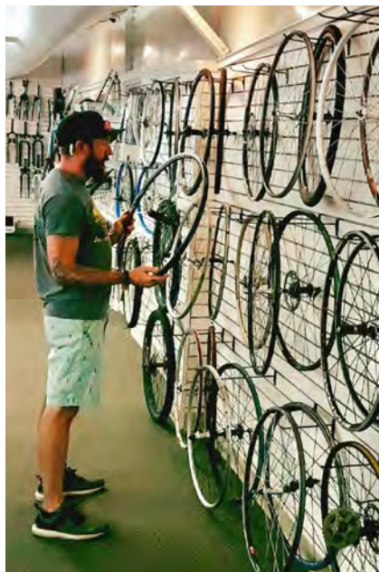
BEST BIKES, SUPPLIES, AND SERVICES Indian Cycle