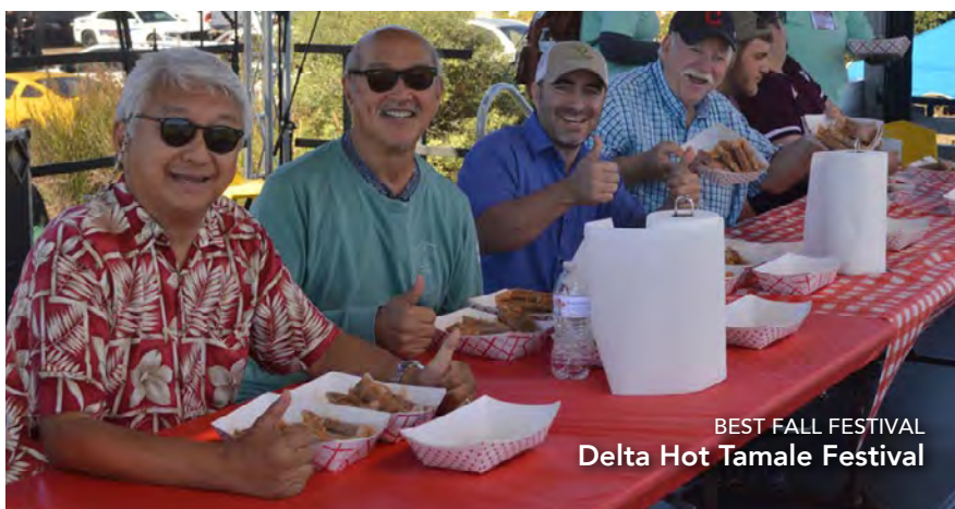
BEST FALL FESTIVAL Delta Hot Tamale Festival

Maritime and Seafood Industry Museum, Biloxi Mississippi Arts + Entertainment Experience (The MAX), Meridian Mississippi Industrial Heritage Museum (Soule' Steam Feed Works), Meridian Museum of Natural History, Jackson Two Mississippi Museums, Jackson