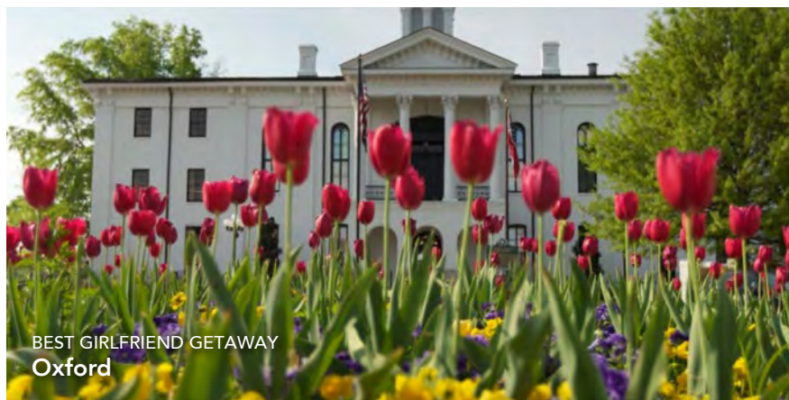
BEST GIRLFRIEND GETAWAY Oxford