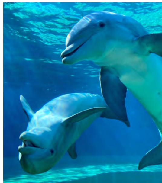
BEST ANIMAL/WILDLIFE ATTRACTION Mississippi Aquarium

Walter Anderson Museum of Art, Ocean Springs