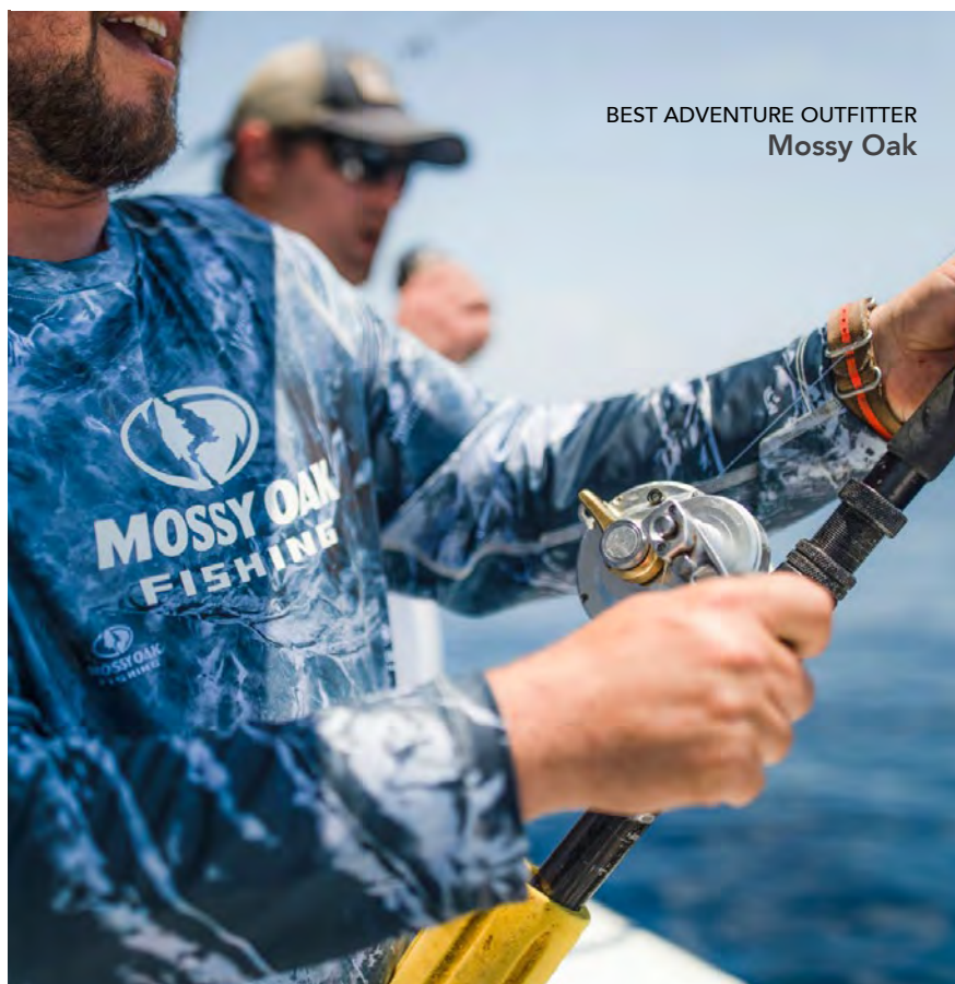
BEST ADVENTURE OUTFITTER Mossy Oak

Aberdeen RV, Aberdeen Camper Corral, Madison Camping World, Jackson Rocket RV, Columbus