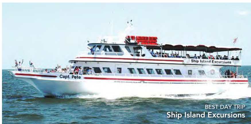
BEST DAY TRIP Ship Island Excursions