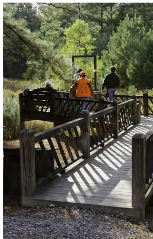
BEST SPORTS SHOOTING FACILITY Providence Hill Farm LLC

Bonita Lakes Park, Meridian Longleaf Trace, Hattiesburg Natchez Trace Chisha Foka Multi-Use Trail, Ridgeland Ocean Springs Live Oak Bicycle Trails, Ocean Springs