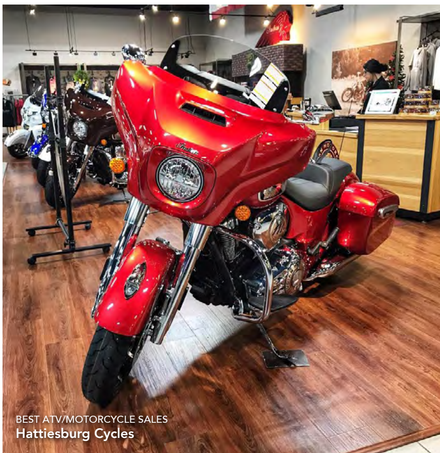
BEST ATV/MOTORCYCLE SALES Hattiesburg Cycles

Grenada Bad Boys, Grenada Got Gear Motorsports, Ridgeland Hellfighters, Laurel Jackson Motorsports, Jackson Meridian Cycles, Meridian