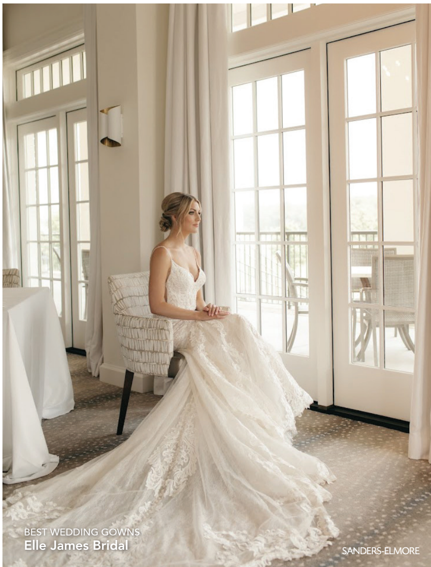
BEST WEDDING GOWNS Elle James Bridal

Elle James Bridal, Ridgeland Kay's Kreations, Tupelo Mimi's Bridal & Formalwear, Laurel The Bridal Path, Jackson Vows Bridal, Brookhaven