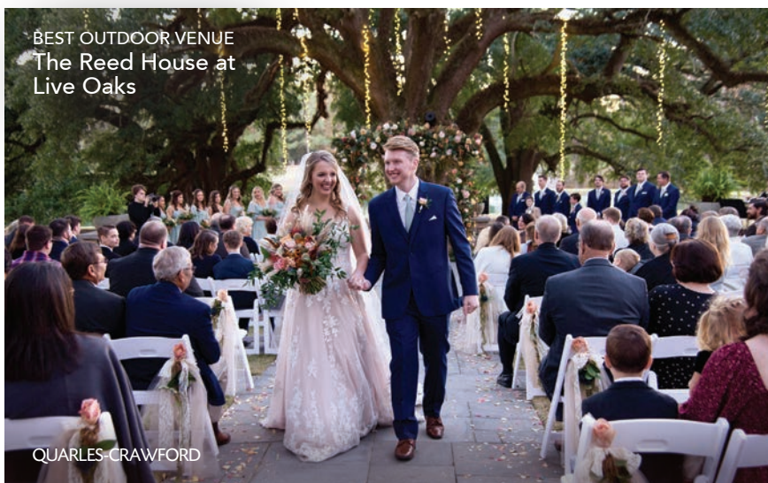
BEST OUTDOOR VENUE The Reed House at Live Oaks