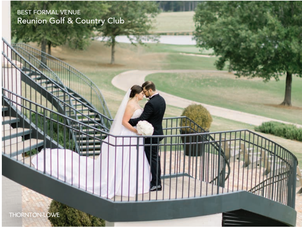
PURPOSEFULLY GIVEN PHOTOGRAPHY