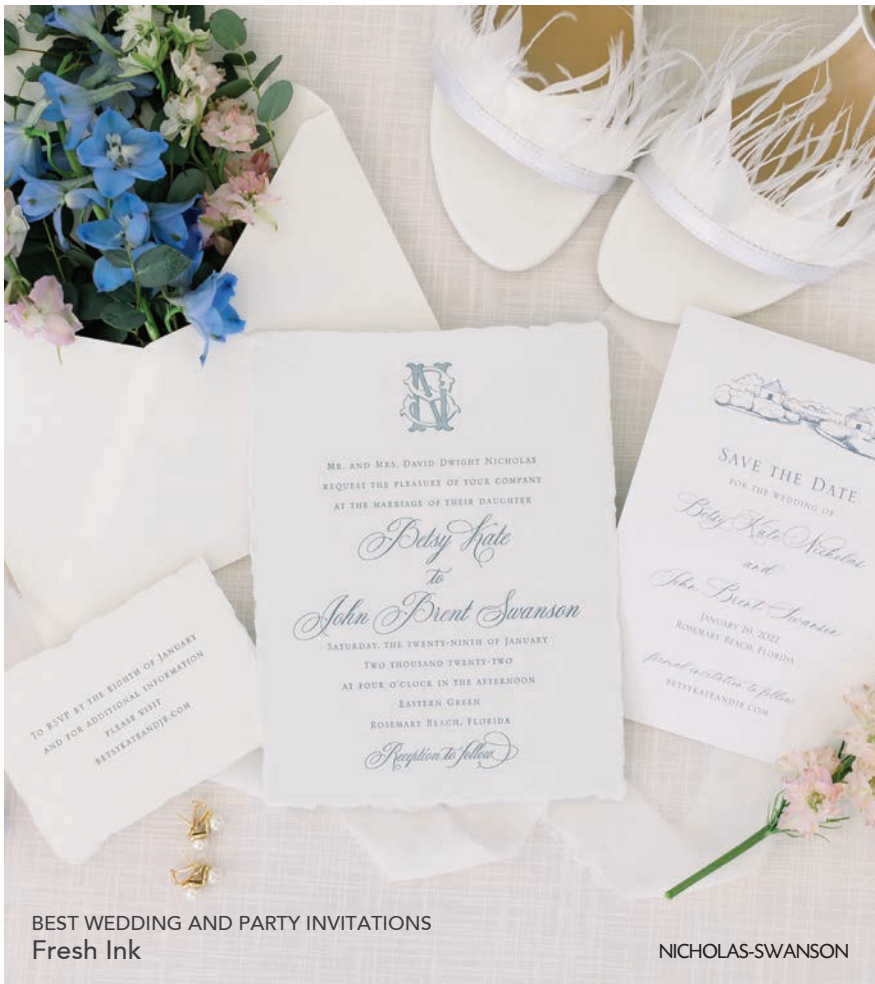
BEST WEDDING AND PARTY INVITATIONS Fresh Ink