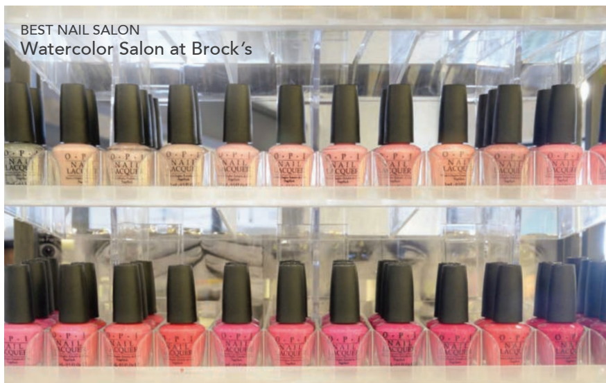
BEST NAIL SALON Watercolor Salon at Brock's