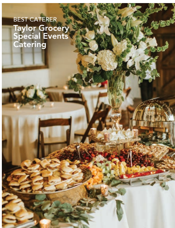
BEST CATERER Taylor Grocery Special Events Catering

Cakes by Cara, Jackson Cakes by Iris, Richland Cups-N-Cakes Bakery, Louisville Once Upon a Cupcake, Vicksburg Sweet Lou's Cakes