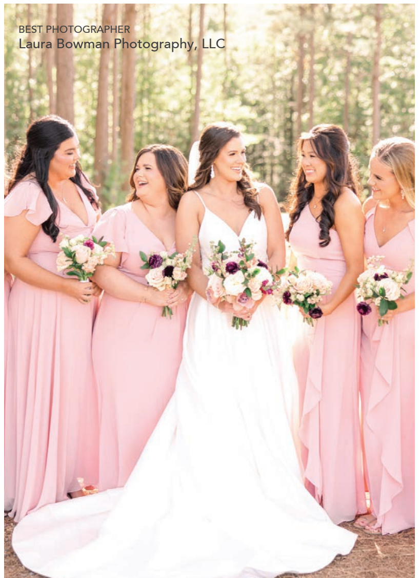
BEST PHOTOGRAPHER Laura Bowman Photography, LLC