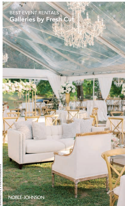
BEST EVENT RENTALS Galleries by Fresh Cut