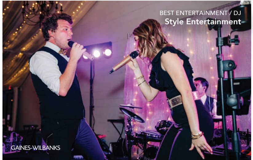
BEST ENTERTAINMENT / DJ Style Entertainment