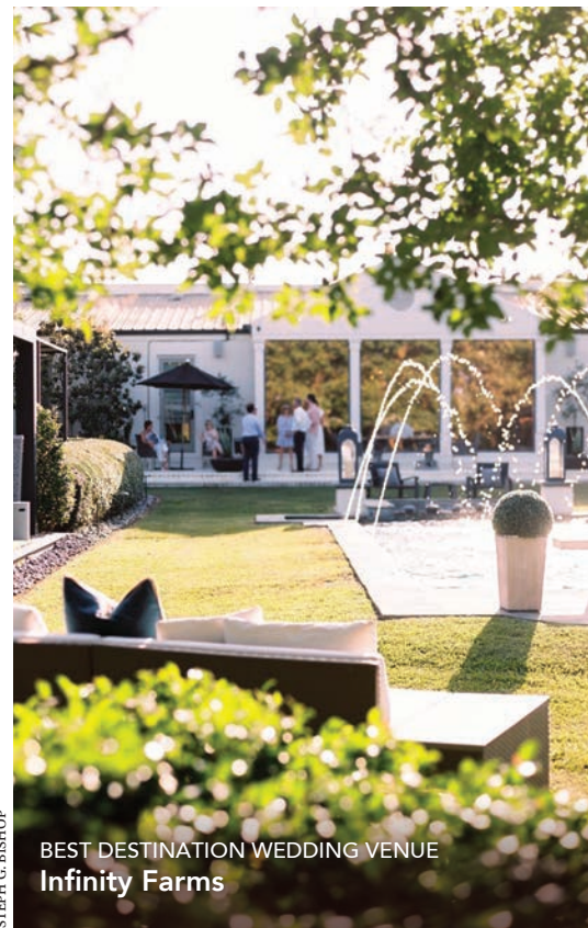
STEPH G. BISHOP

BEST DESTINATION WEDDING VENUE Infinity Farms