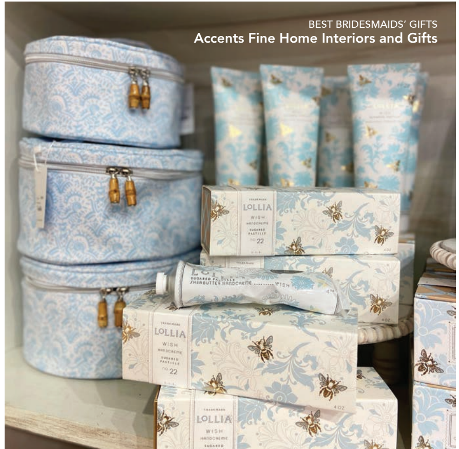
BEST BRIDESMAIDS' GIFTS Accents Fine Home Interiors and Gifts