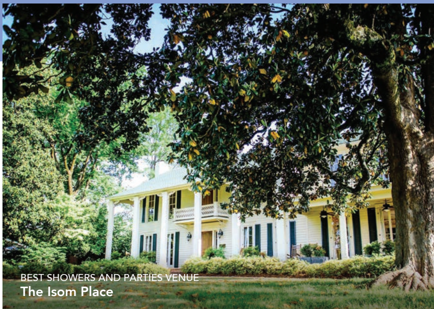
BEST SHOWERS AND PARTIES VENUE The Isom Place