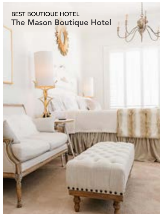
BEST BOUTIQUE HOTEL The Mason Boutique Hotel