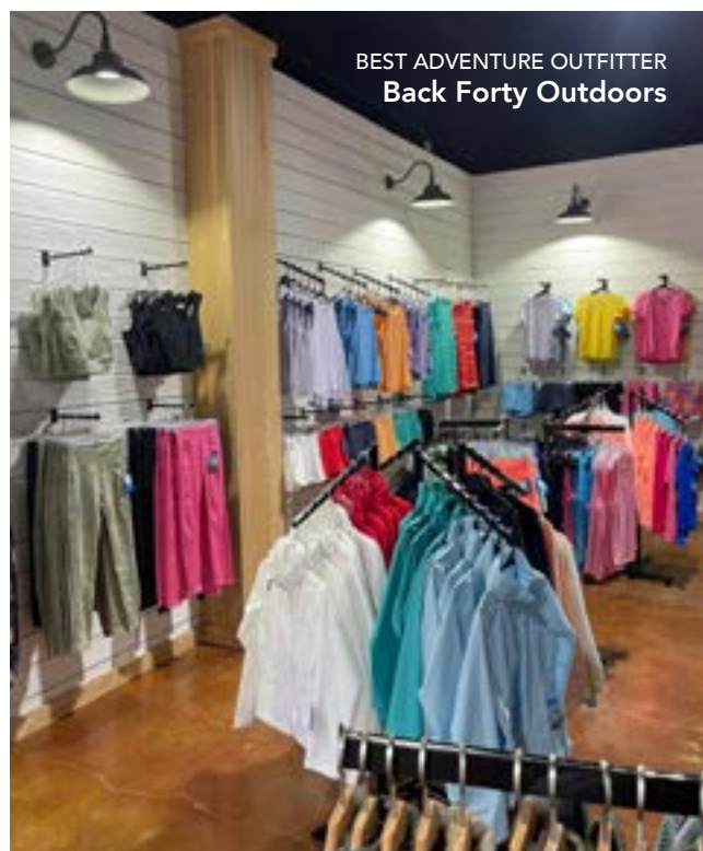
BEST ADVENTURE OUTFITTER Back Forty Outdoors