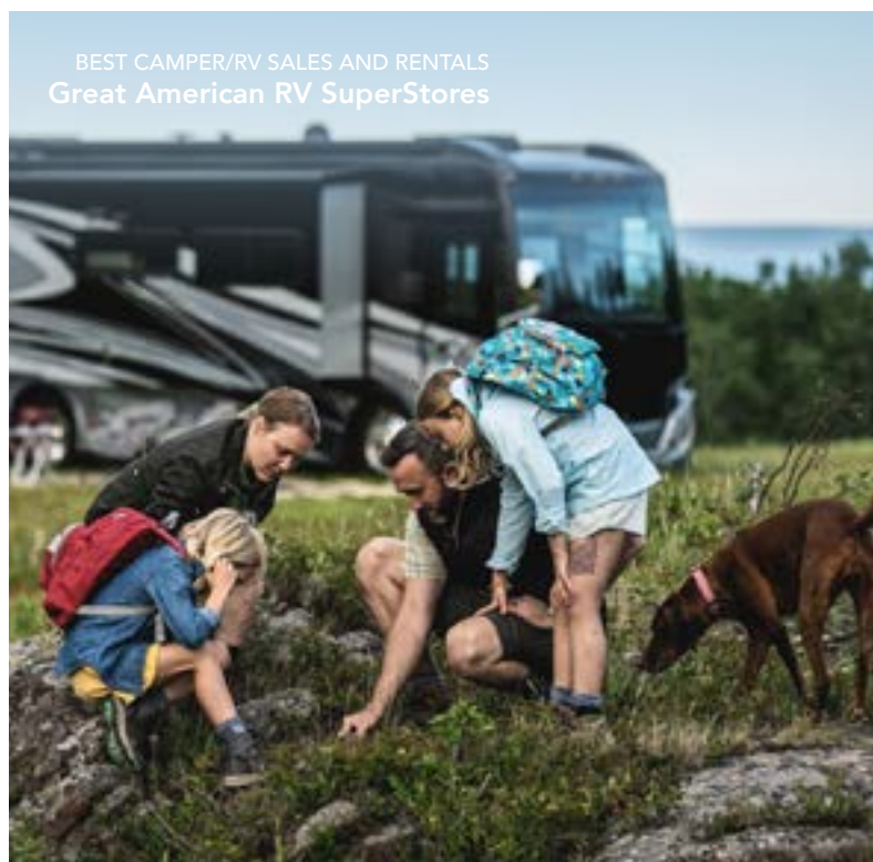
BEST CAMPER/RV SALES AND RENTALS Great American RV SuperStores