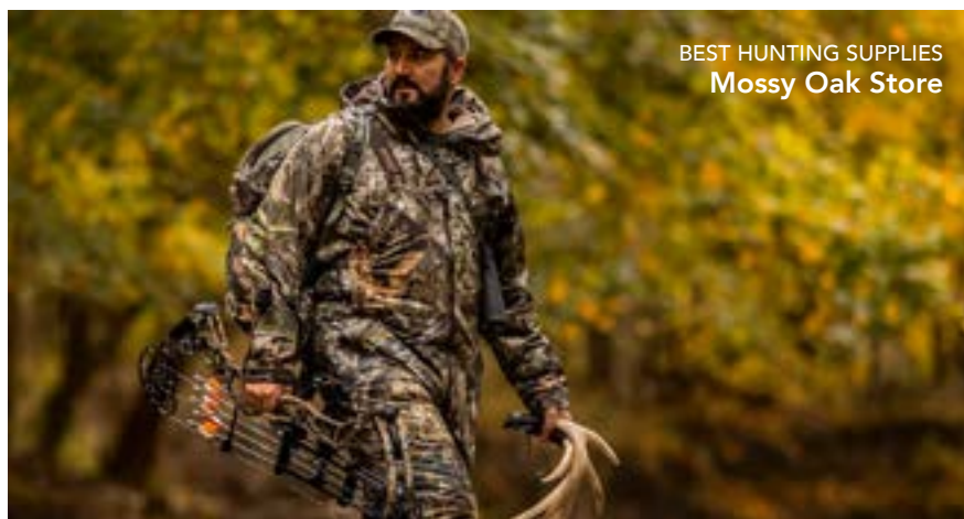
BEST HUNTING SUPPLIES Mossy Oak Store

Adventure ATV, West Point Brookhaven Honda, Brookhaven Hattiesburg Cycles, Hattiesburg Hellfighters Motorcycle Shop, Laurel Main Street Cycle, Tishomingo