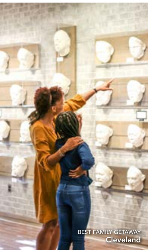
BEST FAMILY GETAWAY Cleveland