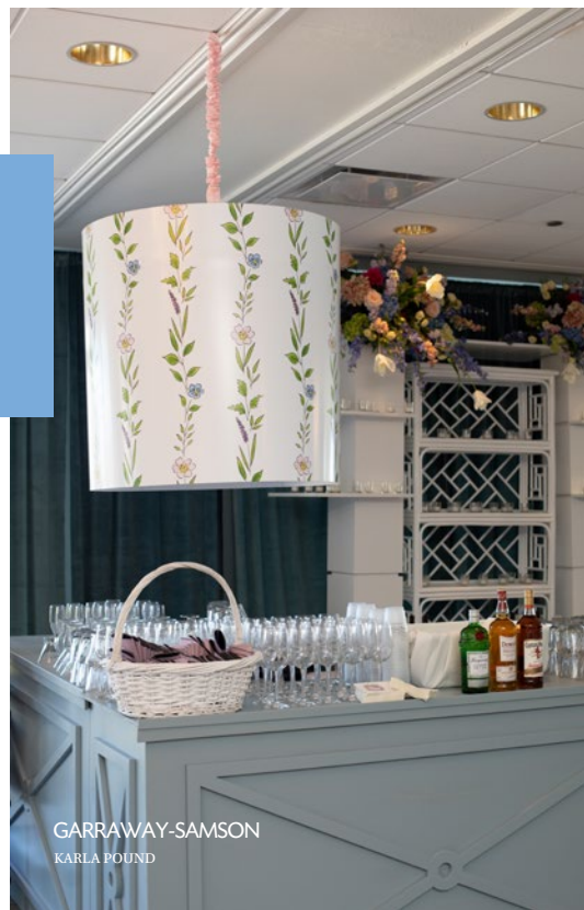
GARRAWAY-SAMSON KARLA POUND