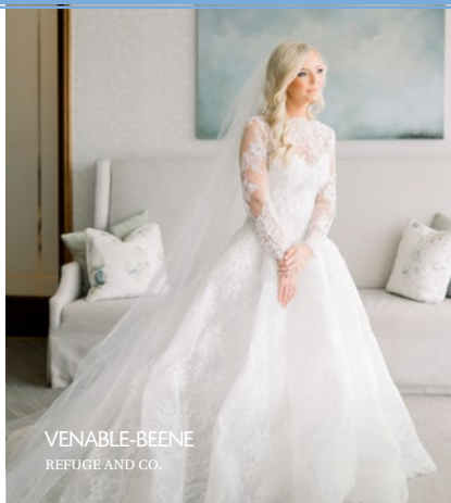
VENABLE-BEENE REFUGE AND CO.